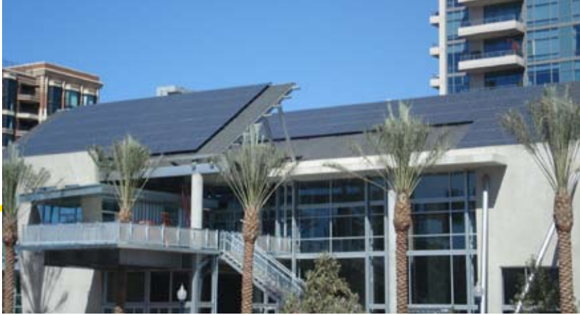
IES 115kW system at The New Children's Museum (San Diego)

Founded in 1998, Independent Energy Solutions, Inc. (IES) is a full-service, renewable energy development, engineering, and construction firm with industry-leading experience in photovoltaics (PV) and support infrastructure. IES projects span the globe and come in every size from small commercial to full, utility-scale applications.