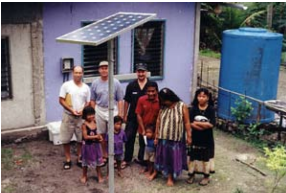
Remote power in Micronesia

Independent Energy Solutions, Inc. 1090 Joshua Way Vista, CA 92081 Tel: (760) 752-9706 Fax: (760) 752-9758 Email: info@indenergysolutions.com www.indenergysolutions.com CA Lic. 805159 · AZ Lic. 243122