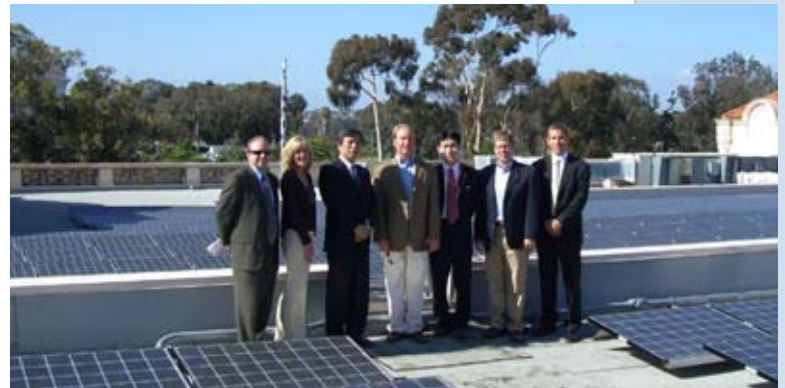
IES 120kW system at world-renowned Reuben H. Fleet Science Center

IES provides the "total solution" -- one that's tailored to your energy needs, local rate structures, available rebate and incentive programs, and unique site requirements. We do all the appropriate design, engineering, procurement and construction needed to make sure your system is safe, reliable and cost-effective. Regardless of project size, location or complexity, IES is committed to providing its customers with excellent service.